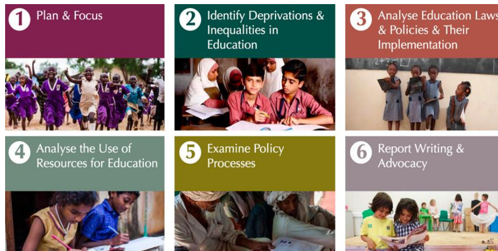
RTE's Monitoring Guide

RTE continued developing and improving its Guide to Monitoring the Right to Education Using Indicators , and updated legal information regarding selected right to education indicators. This unique tool is an interactive guide to monitoring education from a human rights perspective. The Guide consists of six easy-to-follow steps, each step providing guidance on how to gather credible and relevant evidence of human rights violations, using the Right to Education Indicators Selection Tool .