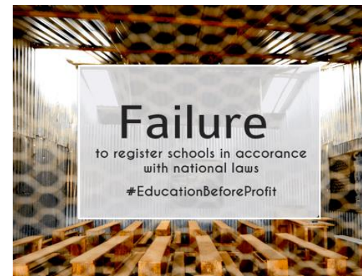
Advocacy campaign on BIA

In April 2017, RTE participated in the Universal Periodic Review Pre-Session in Geneva promoting a joint report on the UK's support to private education in low income, particularly for-profit, low-cost private schools, and its impacts on the right to education. In November 2017, the International Development Committee (IDC) of the UK Parliament published its report on the Department of International Development (DFID)'s work on education: