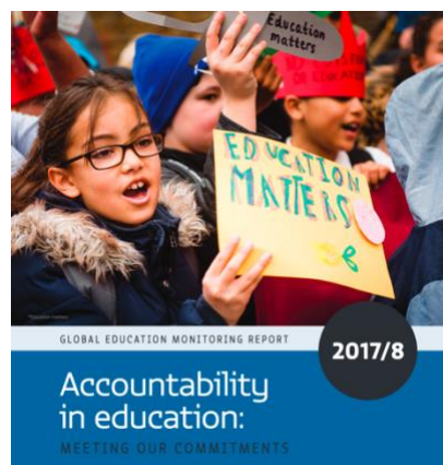
GEM Report 2017/8

In 2017, RTE wrote two background papers for the UNESCO Global