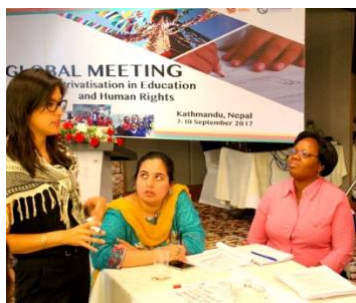
Nepal consultation Sept 2017

In close partnership with the Global Initiative for Economic, Social and Cultural Rights (GI-ESCR), RTE has led on the development of human rights principles on States' obligation related to private schools . These Guiding Principles aim at compile existing customary and conventional human rights law as it relates to