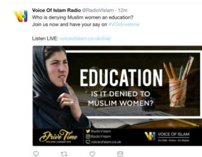
Voice of Islam's tweet

In April 2017, RTE participated in Voice of Islam radio show on Muslim girls' right to education