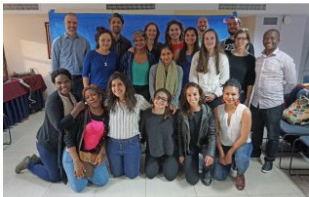
ESCR-Net Monitoring Working Group meeting in Mexico, February 2020